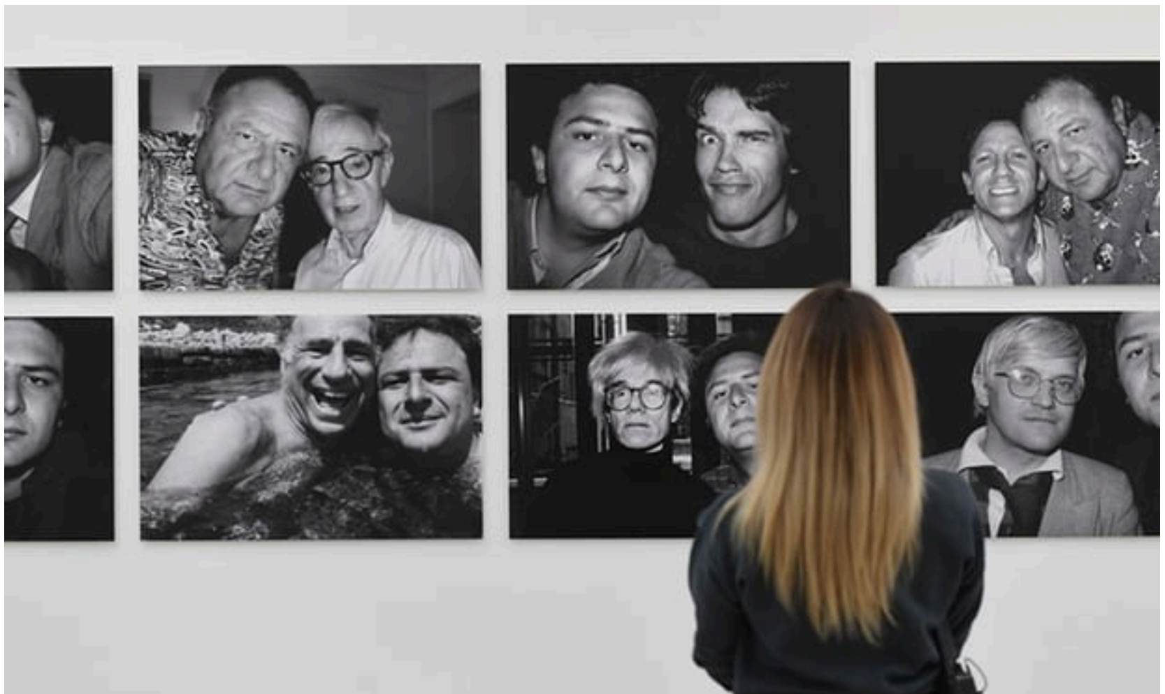
A guest at a preview.