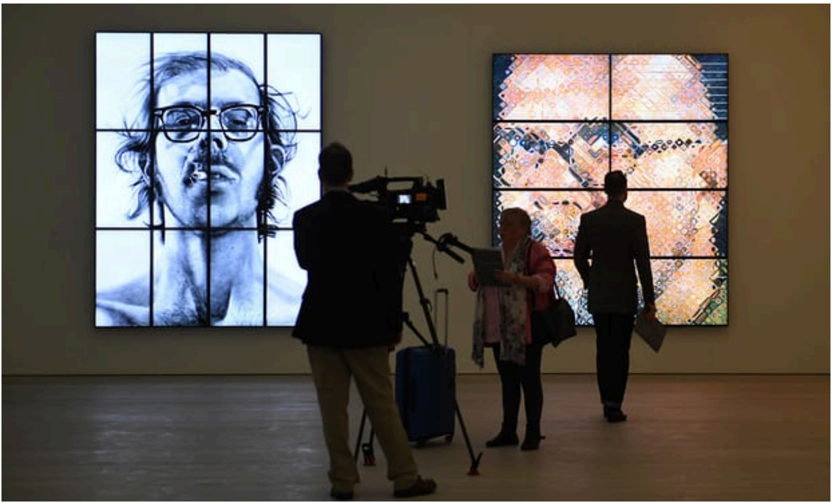
Journalists and guests attend the press view.