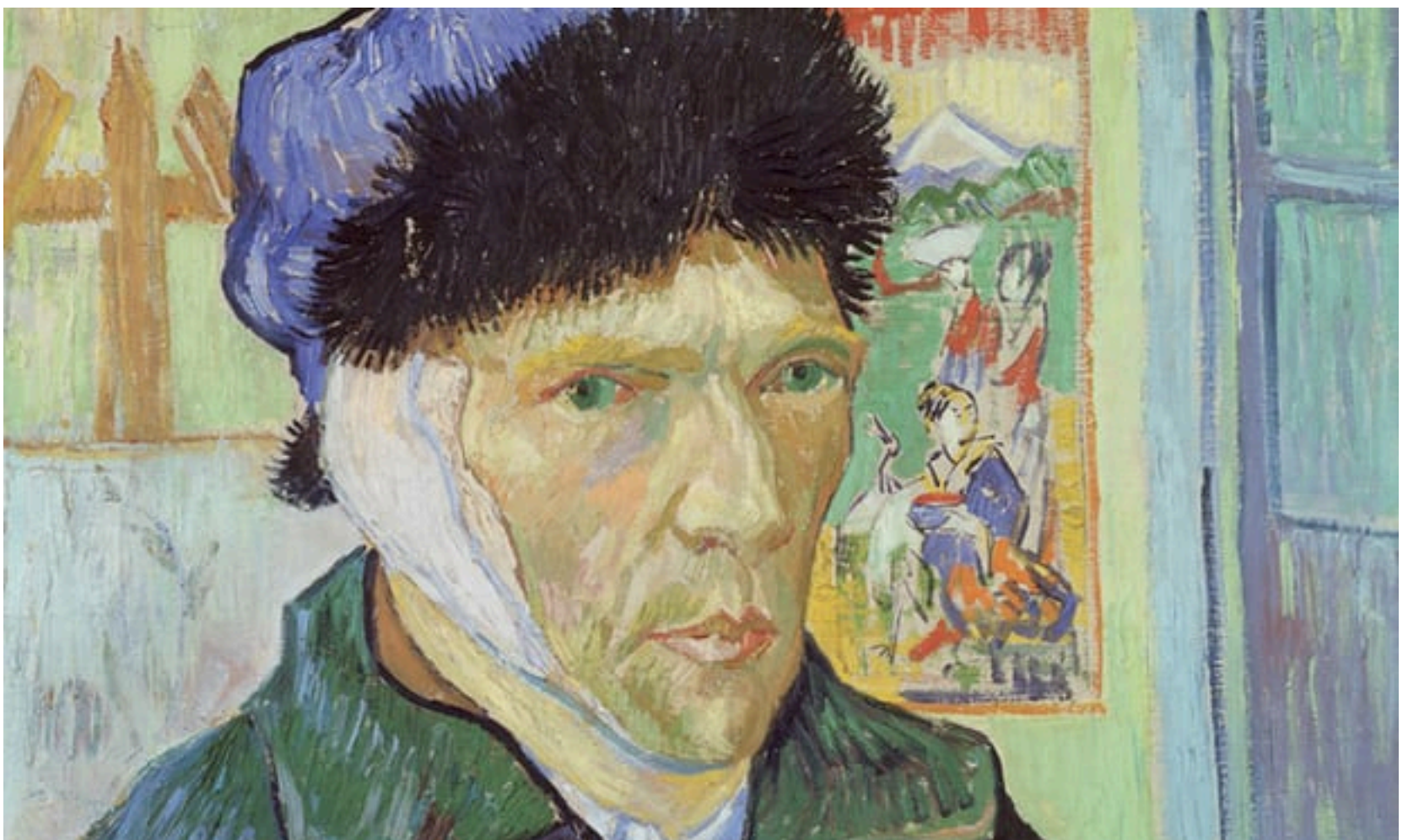
A detail from an 1889 self-portrait by Vincent van Gogh that features in From Selfie To Self-Expression at the Saatchi gallery in London.